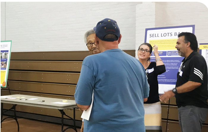
Informal meet and greet before the official event kick-off.