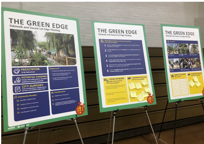
Station #5: The Green Edge