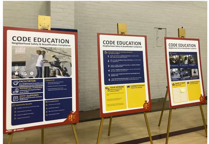
Station #2: Code Education