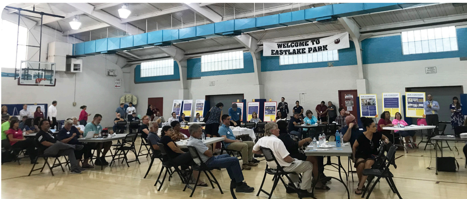
59 participants attended the meeting that evening.