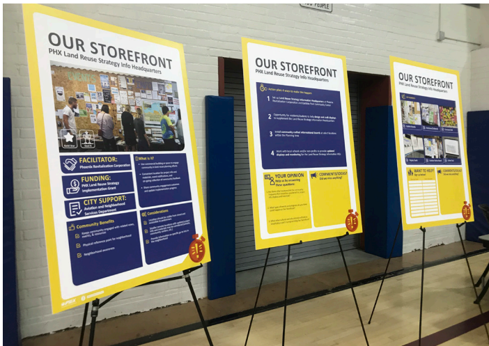
Station #3: Our Storefront