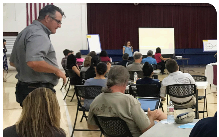
Attendees participated in a Quick Hits online survey.