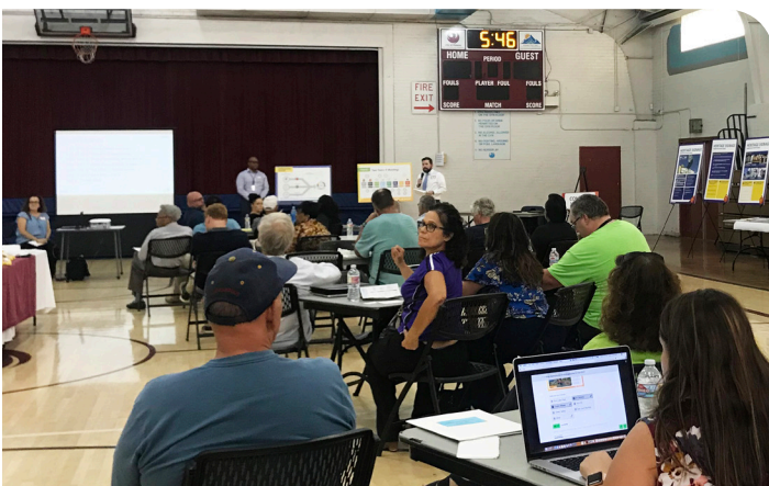
City staff welcomed the public to the open house.